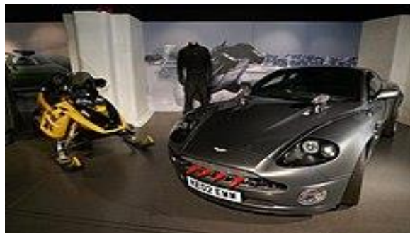
Aston Martin V12 Vanquish and Bombardier MX Rev Ski-Doo used in the film